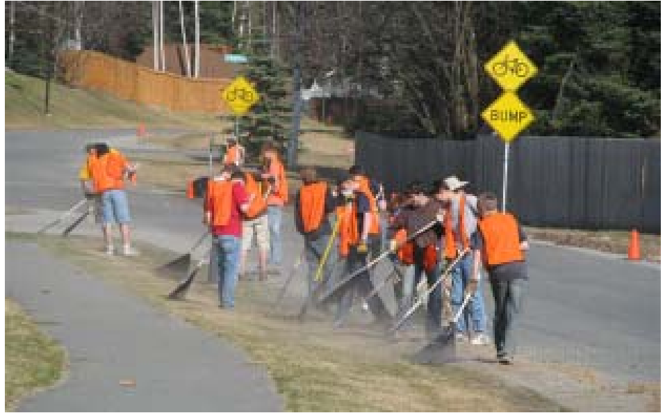
Eaglewood Association raking crew hard at work cleaning winter debris.

The pay starts at $7.25 per hour for new employees. Returning employees