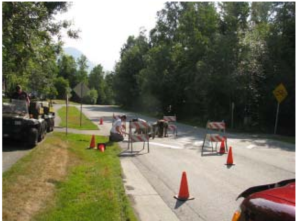
Work crews busy painting temporary speed bump on Montague Loop.

" ... 4 cars were doing over 65 mph. Driving those speeds on Montague Loop is just plain careless and dangerous."