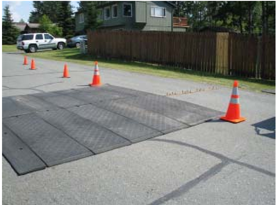
Speed bump installation underway in an attempt to curb speeding motorists.

The Board is unsure if that is the right spot in that section of road for a permanent speed hump and we are in the process of trying to get another speed study done. So at this point it has to be considered "a work in progress". The Board of Directors would like to hear your feedback on this, pro or con. Call 694-6942 and leave a message or email us at admin@eaglewoodassn.com .